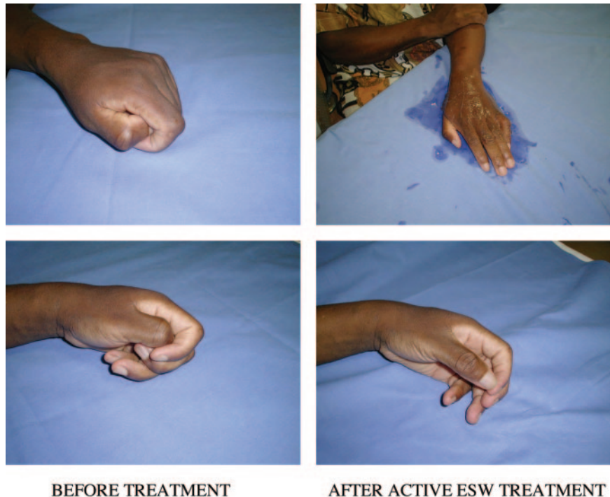
Figure 2. Clinical findings in a patient.

The major finding of this study is that a single, active treatment of shock wave therapy on spastic muscles of upper limb in patients affected by stroke resulted in a significant reduction in muscle tone. No effect was noted after placebo stimulation. The effect of active stimulation lasted \geq 12 weeks after therapy. In particular, a significant effect on the muscle tone of the finger flexors was noted. No adverse effects were observed in any patient, and no