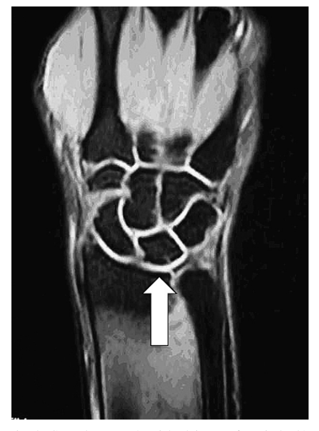
Fig. 3. Coronal NMR T2-weighted images for Kienböck's disease Stage I patient. Sixty days after treatment, the bone marrow edema is absent.

The most satisfactory results in our study were in the VAS pain scores, and these were particularly pleasing when compared with those found in the literature. In all the studies analyzed by Innes and Strauch (2010) (which