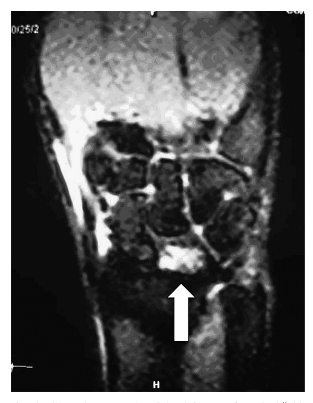
Fig. 2. Coronal NMR T2-weighted images for Kienböck's disease Stage I patient. Note the normal shape of the lunate before ESWT treatment. The arrow marks the increased bone marrow density (bone marrow edema).

osteoprogenitor cells. More recently, Tamma et al. (2009) reported that shock wave stimulation induces bone repair through the proliferation and differentiation of osteoblasts.